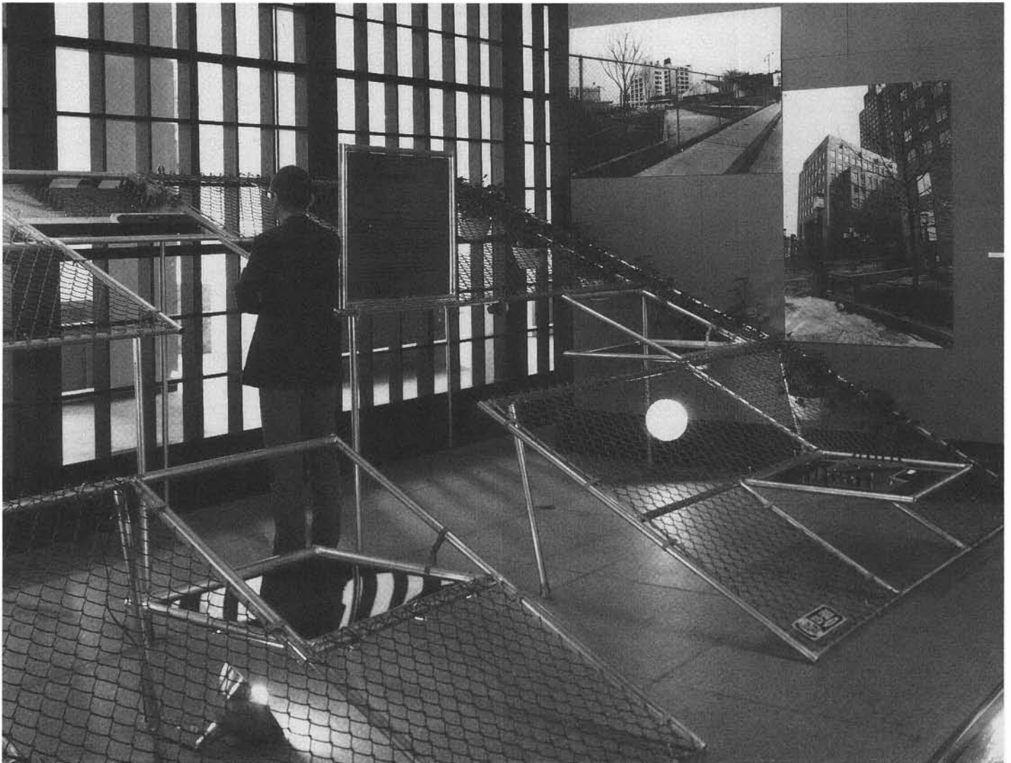
Vito Acconci, proposal for public garden, MetroTech Center, Brooklyn, New York. Installation at Paine Webber Art Gallery.