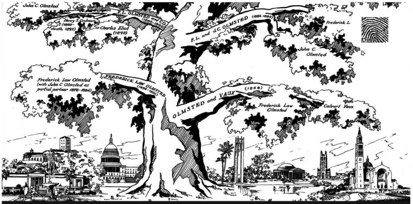
Detail from Olmsted Family Tree, 1858-1958