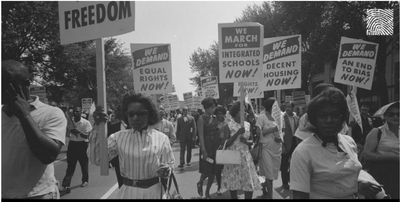
Civil Rights March on Washington, D.C. - Photo by Warren K. Leffler courtesy Library of Congress, 1963